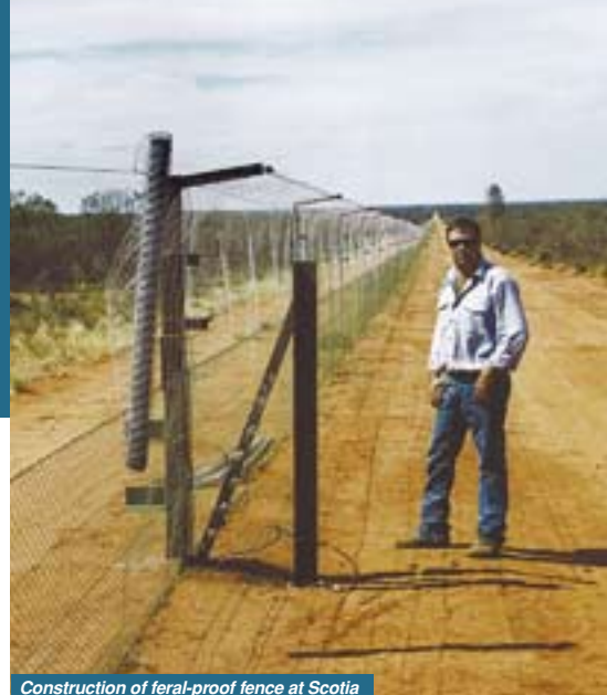
Construction of feral-proof fence at Scotia