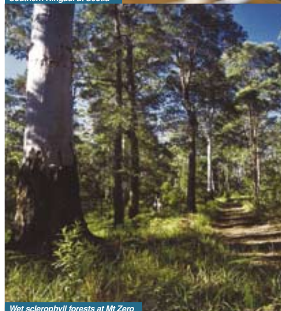
Wet sclerophyll forests at Mt Zero