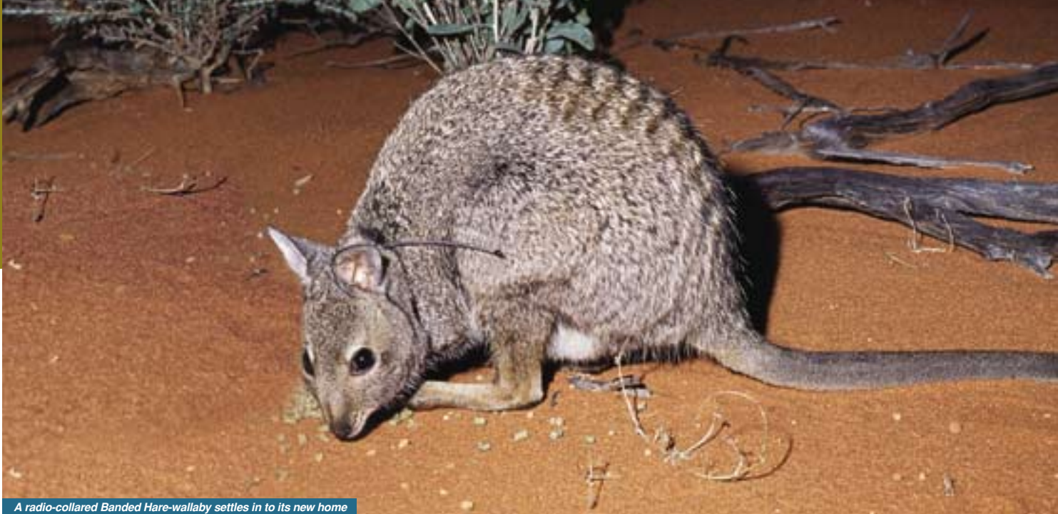
A radio-collared Banded Hare-wallaby settles in to its new home