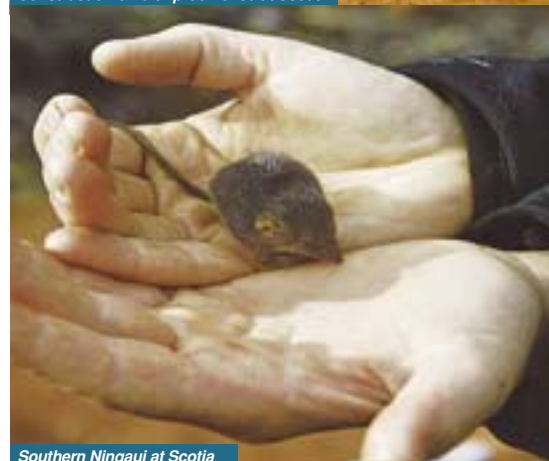
Southern Ningauai at Scotia