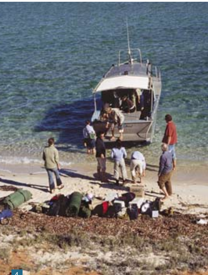
Unloading our precious cargo on Faure Island

It's difficult to describe the feeling of seeing such a special creature after only ever seeing specimens in books, and even harder to convey the emotion involved in actually holding one of these animals in your hands, feeling its heart beat against your chest, and then