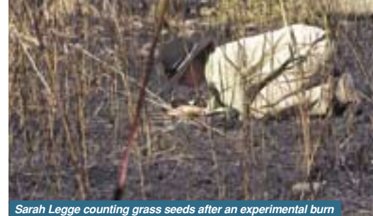
Sarah Legge counting grass seeds after an experimental burn