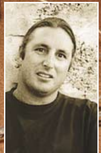
Tim Winton on Faure Island

provides new hope for the Banded Hare-wallaby