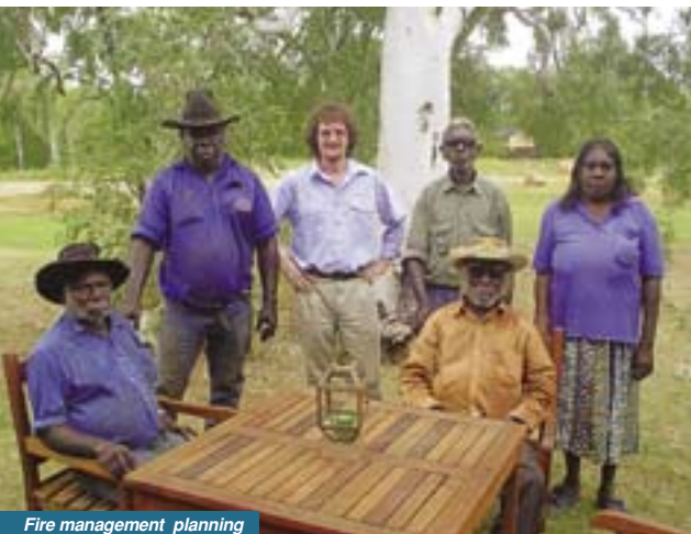
Fire management planning

AWC acknowledges the support and assistance of members of the Tirralinjti and Tablelands aboriginal communities, whose contribution is vitally important to conservation activities at Mornington.