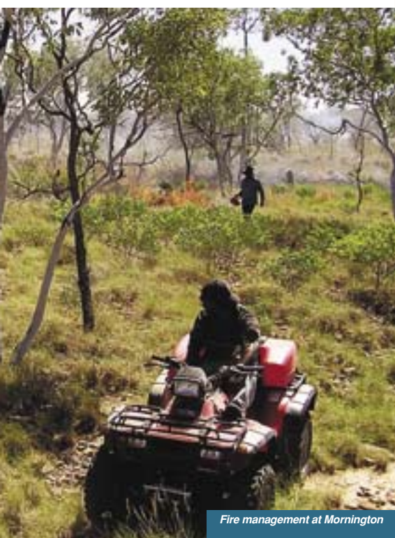
Fire management at Mornington